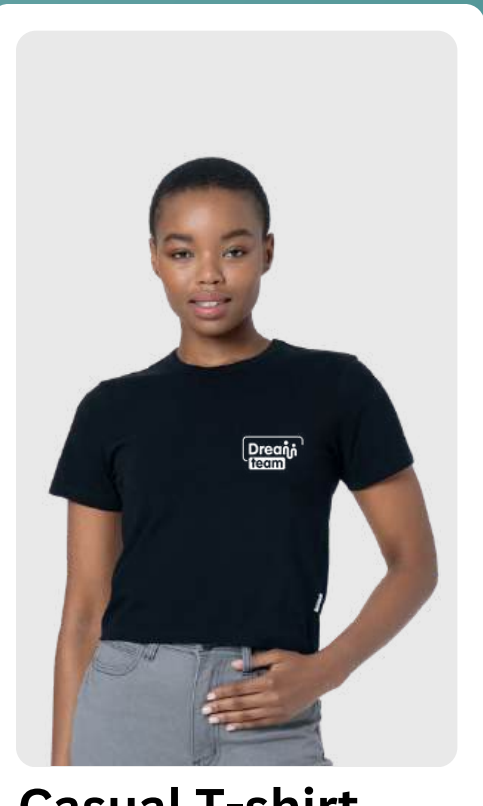
Casual T-shirt black R120